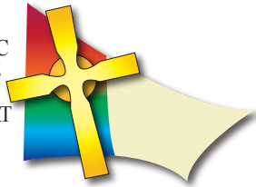
CATHOLIC DIOCESE of BALLARAT