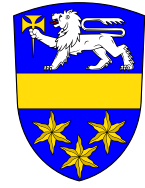
CATHOLIC DIOCESE OF SALE