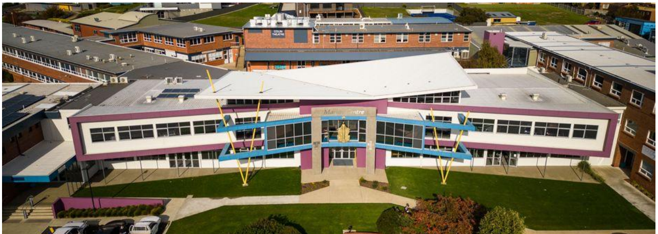
Marist Regional College, Burnie

For further information click the following link to access the Marist Regional College website: https://www.mrc.tas.edu.au/