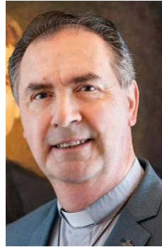
Fr Fernández Artime Ángel, Rector-Major